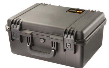
Transport & Storage Case Option

NOTE: This instrument is considered HAZMAT and requires HAZMAT training to ship. Please see the instrument manual for details.